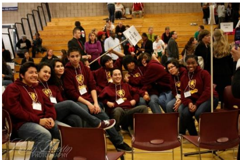
Academic Decathlon Team