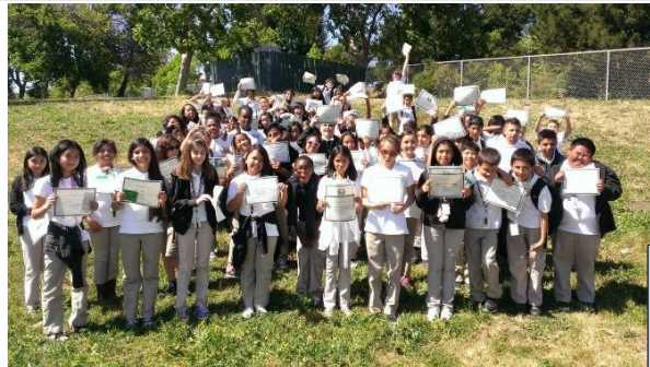
6 th Grade Honor Roll!

A Feather for a Griffin! For two years in a row, MIT has won the statewide “Mission: Admission” college-admission contest sponsored by the University of Southern California!