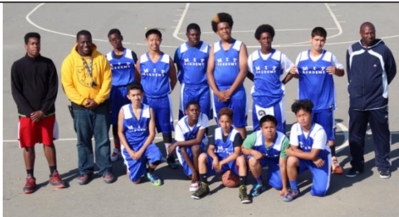
Champion middle school bb team!