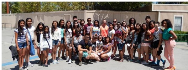
Champion Colorguard Team