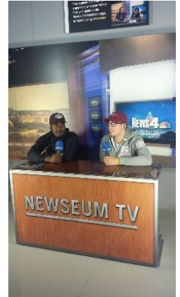
Griffin TV broadcasting from Washington DC