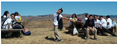
Lynch Canyon fieldtrip